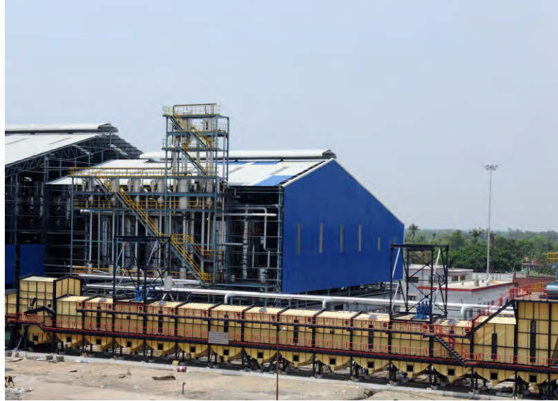
Chainless Cane Diffuser with Low Pressure Heating Module (LPHM) at HPCL Biofuels, Sugauli (Bihar) India