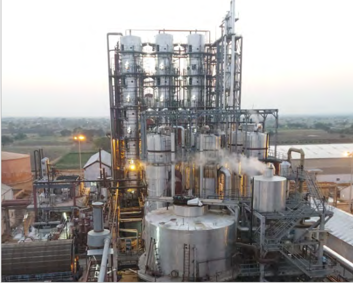
5000 TCD Sugar Plant with 40 MW Co-generation at Twentyone Sugars Ltd., Maharashtra, India