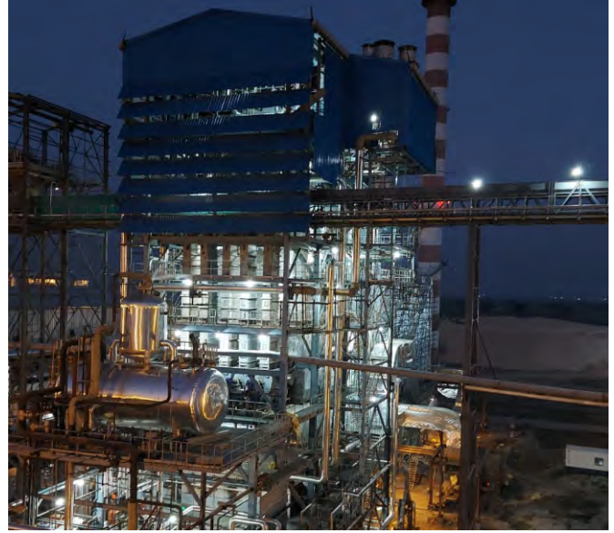
150 TPH Bagasse Fired Boiler at Twentyone Sugars Ltd., Latur (Maharashtra), India